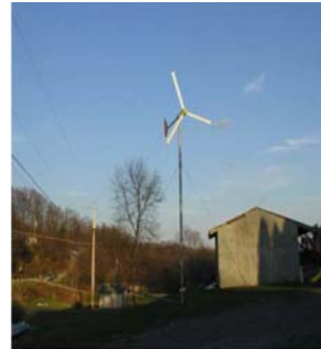
300W Wind Turbine

Installed power: 2240W 6Mts wind power Tower Kit CE standard wind turbine with 25 years life span and power 2000W Solar Panels: 8pcs 30W array (High Quality and efficient mono/polycrystalline solar modules with 25 years life span and power 240W) Intelligent wind & solar system control kit 3000W pure sine wave inverter Wind system cables Solar power modules connection cables Charging voltage: 120V DC Battery matching: 10pcs 12v-200AH Battery connection: Tandem & parallel connection Installation complete kit of accessories