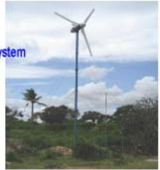
3000w WIND power system

Installed power: 3400W 6Mts wind power Tower Kit CE standard wind turbine with 25 years life span and power 3KW Solar Panels: 10pcs 40W solar power modules (High Quality and efficient mono/polycrystalline solar modules with 25 years life span and power 400W) Intelligent wind & solar LCD controller 5000W pure sine wave inverter Wind system cables Solar power modules Connection cables Charging voltage: 240V DC Battery matching: 20pcs 12v-150AH Battery connection: Tandem connection & parallel connection Installation complete kit of accessories