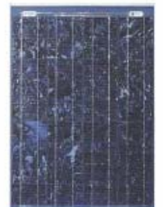
50W Solar Panel