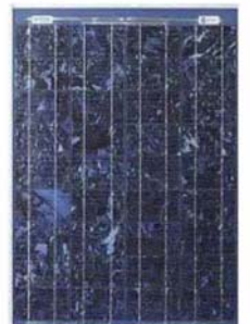
40W Solar Panel