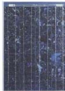
400WATTS SOLAR SYSTEM