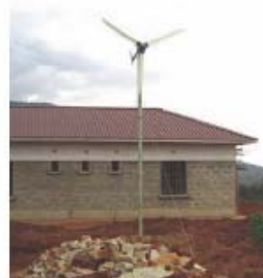
1000W Wind Turbine