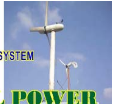
5000W WIND SYSTEM

Installed power: 5600W 6Mts wind power Tower Kit CE standard wind turbine with 25 years life span and power 5000W Solar Panels: 10pcs 60W array (High Quality and efficient mono/polycrystalline solar modules with 25 years life span and power 600W) Intelligent wind & solar system control kit 8000W pure sine wave inverter Wind system cables Solar power modules connection cables Charging voltage: 240V DC Battery matching: 20pcs 12v-200AH Battery connection: Tandem & parallel connection Installation complete kit of accessories